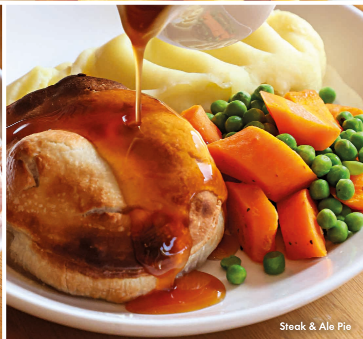
Steak & Ale Pie