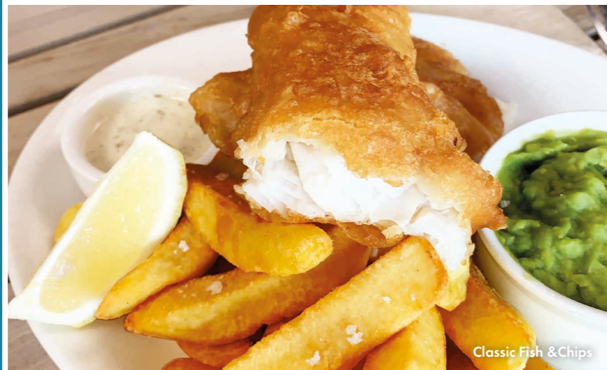
Classic Fish & Chips