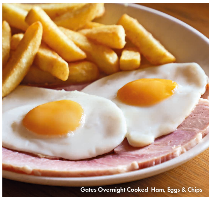
Gates Overnight Cooked Ham, Eggs & Chips