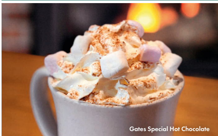
Gates Special Hot Chocolate