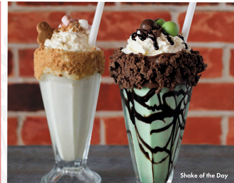
Shake of the Day