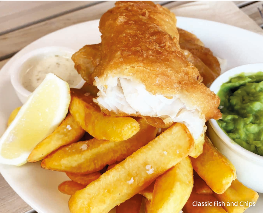
Classic Fish and Chips