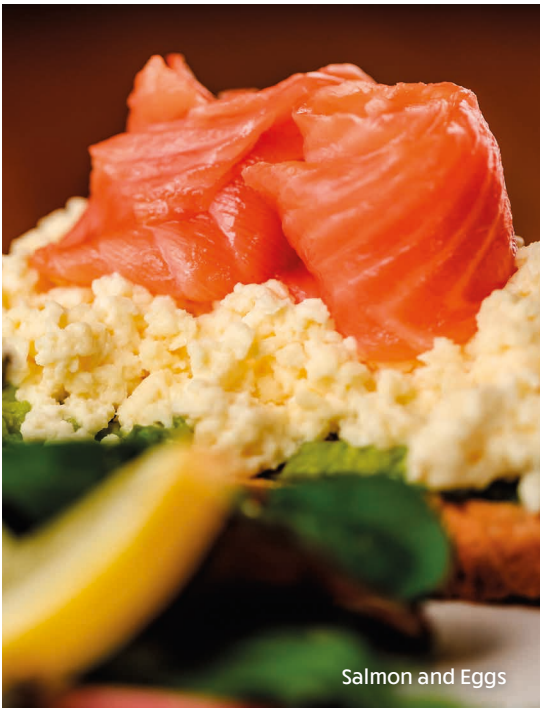
Salmon and Eggs