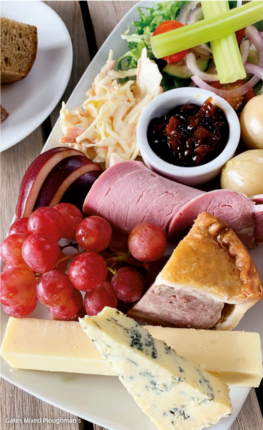
Gates Mixed Ploughman's