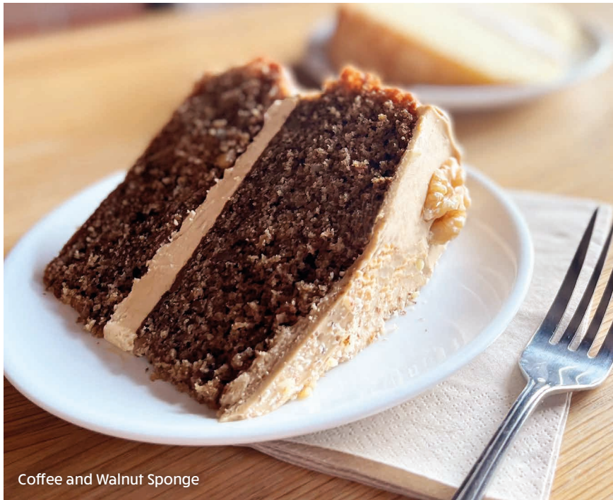
Coffee and Walnut Sponge