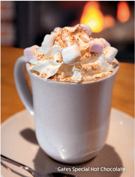
Gates Special Hot Chocolate